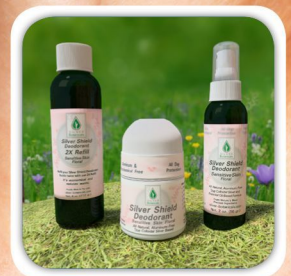
Sensitive Skin Floral Formula