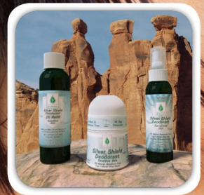
Sensitive Skin Formula